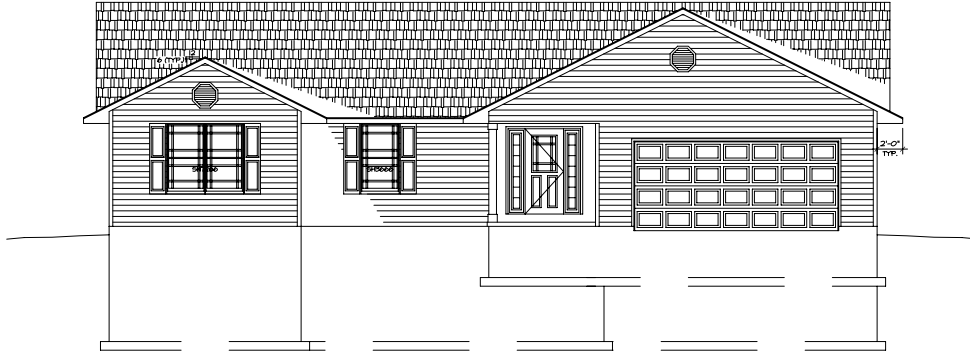
1 FRONT ELEVATION A-1 SCALE: 1/4"=1'-0"